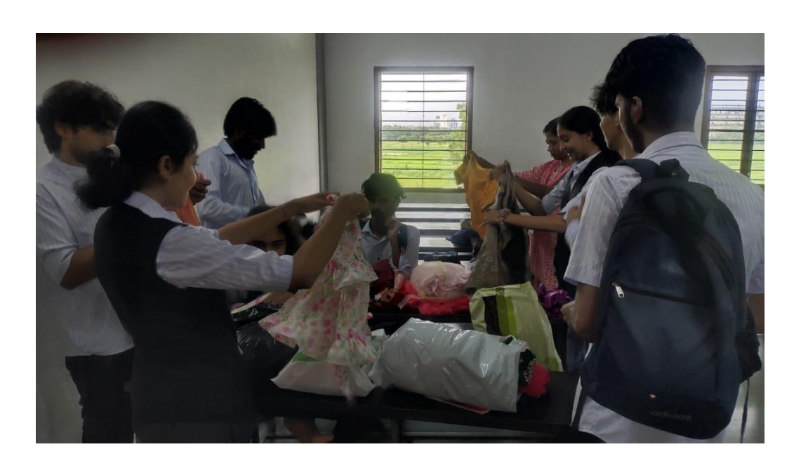
Cloth donation in the academic year 2023-24

❖ The practice of donating clothes to the cloth bank helped to instill a sense of humility and fostered a sense of social responsibility among students. Donating clothes to cloth bank not only helped students contribute to their community but also nurtures important values and skills that are beneficial for their personal and academic growth.