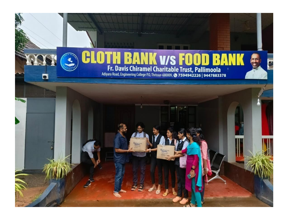
Cloth donation in the academic year 2024-25